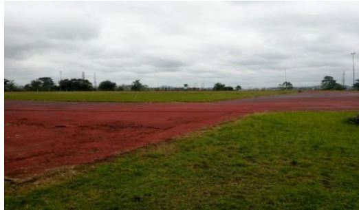
Figure 2: Football Pitch with Tracks in FUTA