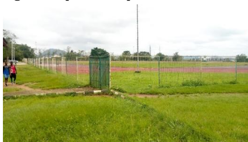
Figure 4: Sports Complex in FUTA