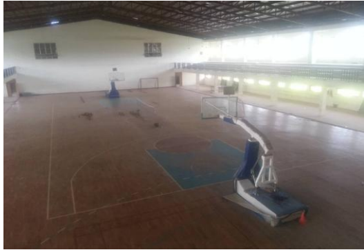
Figure 6: Basketball Court in AAUA