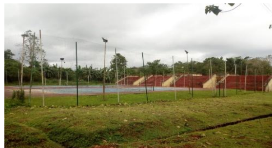
Figure 3: Tennis Court in FUTA