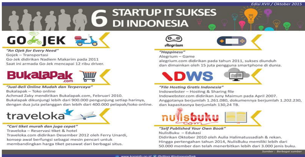
Figure 1: Successful Startup infoGraphics in Indonesia 2016, Communication and Information Version

The dynamics and inexperience of the government in understanding the changing patterns of using public transportation in Jakarta, based on the government's interference about the regulations, do not provide a solution but instead, the government includes being a part of the problem. The Ministry of transportation considers that online transportation in regulation was not eligible with the requirements, but in the policy of the President as the highest executive power in the government acts otherwise. The socio-political impact that arises in this confusing area, at least the community understands that: First, the government is not ready for the changes that occur. Second, society wants comfortable, cheap and safe transportation. Third, technology disruption through online applications can bring new patterns in the habit of using public transportation. Fourth, the potential for conflicts that occur in the community due to government uncertainty the online application that has just emerged, is becoming a new competitor in the field of transportation, of course, it has a surprising effect on businessmen and conventional drivers. The government has actually seen this shift, but it is still uncertain given that public transportation still refers to old regulations and has not been modified or adapted to more modern needs.