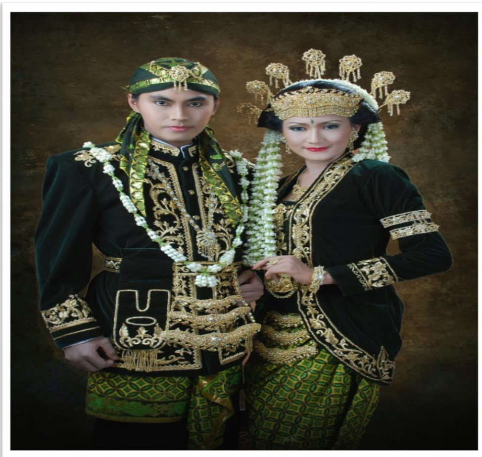
Figure 2: Wedding Dress "Blitar Kartika Rukmi"