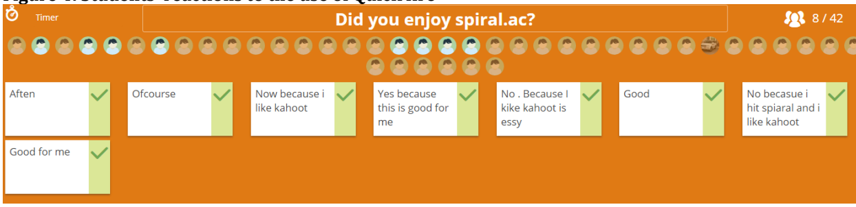
Figure 4: Students' reactions to the use of Quick fire

After eight weeks, participant reported their opinions about the project. The researchers held group interviews with the students and asked them seven open-ended questions. Analysis of students' comments revealed interesting differences between the students in their experience of using the Quick fire application. About half of the students (49 %) reported that they enjoyed the tool. This was not surprising as it was clear from the observation that the students were not so excited about the application. Below is a screenshot that portrays their reactions to spiral: