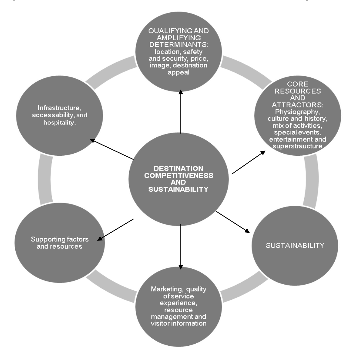
Figure 1: Visitor attraction factors that would contribute to Durban's tourism competitiveness

Source: Factors from Crouch and Ritchie (2003, P, 63)