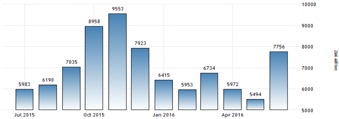
Figure 3: An Overview of Zambian Imports