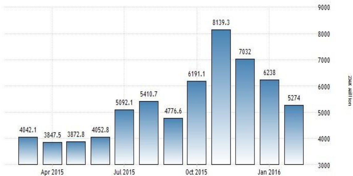
Figure 2: An Overview of Zambian Exports