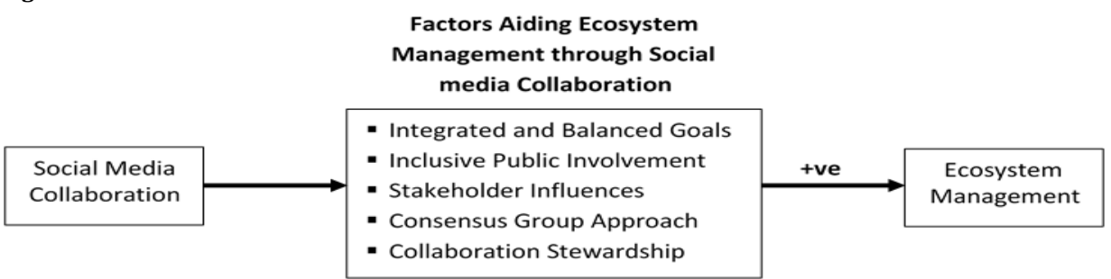
Fig. 1: Research Model

Figure 2 above represents the research model guiding this current study. The model (especially the factors aiding ecosystem management) is adapted from Keough and Blahna (2005). This model is proposed for the study of the relationship between social media collaboration processes and the management of herdsmen/farmers clashes over grazing fields and farmlands – which is the ecosystem in the context of this study. From the model, it is proposed that, if social media collaborations (topical issues discussed) are organized to conform to the five (5) ecosystem management aiding factors, this will lead to a positive relationship with the ecosystem management.