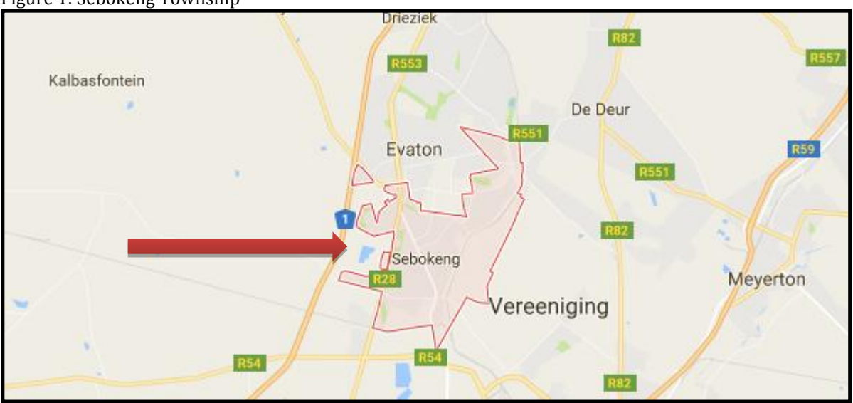
Figure 1: Sebokeng Township