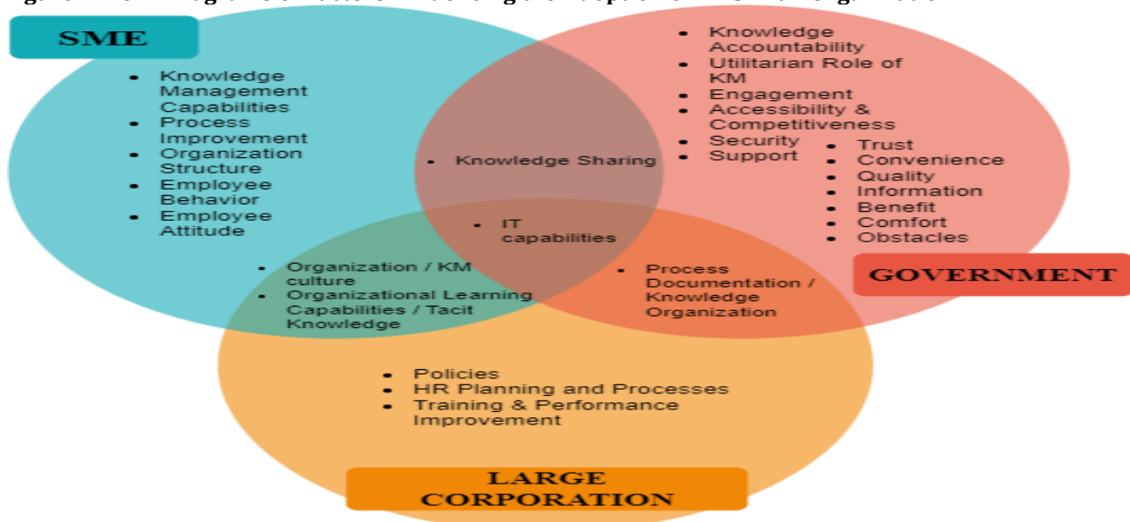
Figure 2: Venn Diagrams of Factors Influencing the Adoption of KMS in an Organization

Organizational learning skills or capturing tacit knowledge are the intercepts for SMEs and large corporations, along with knowledge management culture. Depending on an organization's culture of knowledge management and its learning capacity, these two factors help to explain why it is necessary to implement the KMS. Third, knowledge sharing is a key component in the adoption of KMS as evidenced by the parallels in knowledge-sharing factors between the SME and government when they interact. The likelihood of the organization adopting the KMS will be lower if it has no plans to share information with other organizations. Last but not least, process documentation or knowledge organization is a shared characteristic of both the government and big corporations. This element is crucial for both kinds of organizations to organize and document their knowledge for long-term process sustainability and knowledge transfer.